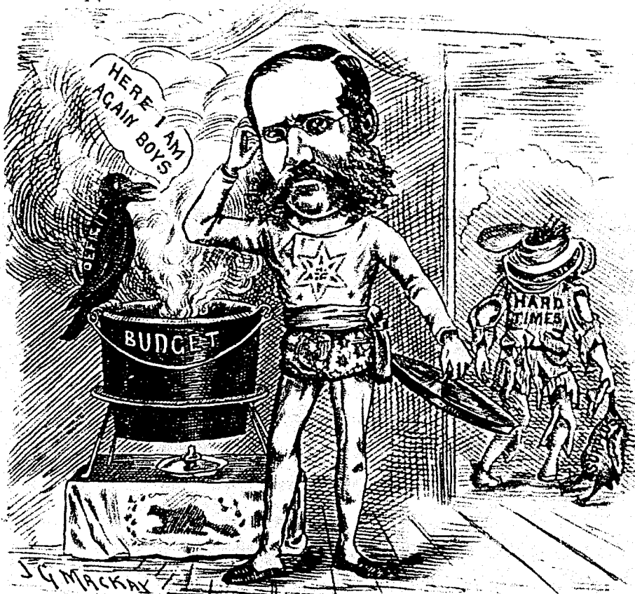
THE BLACK CROW BACK AGAIN.