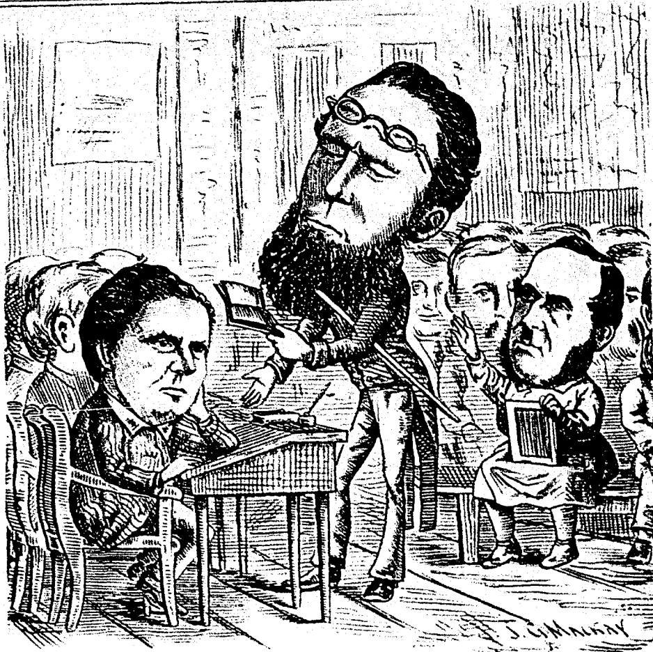
A BAD SPELL.

SCHOOL TEACHER: Well, if I'm not surprised at one of my head boys makin' sic a bungle o' a simple word like ultramontane . I've half a min' to wallop both you and Luther Holton; you for bringin' discredit on the school by your ignorance, an' him for speakin' w/out permission.