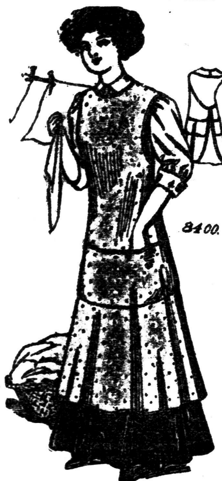
8400—A PRATICAL APRON MODEL.

What woman will not appreciate the value of an apron that is fitted out with a capacious pocket for holding pins on wash day or dust cloths on cleaning days? This apron is made of oilcloth, jean, or gingham. It is cut in one piece, and the pocket covers its entire width. The pattern is cut in three sizes: Small, medium and large. It requires 3½ yards of 36-inch material.