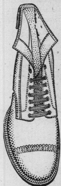
The Regent Leather Lined Blucher.