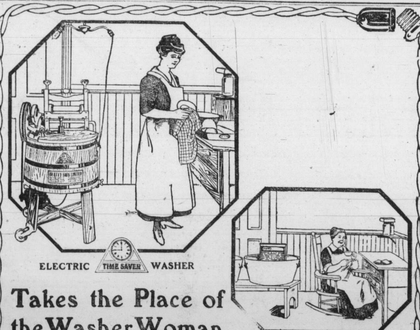
ELECTRIC TIME SAVING WASHER