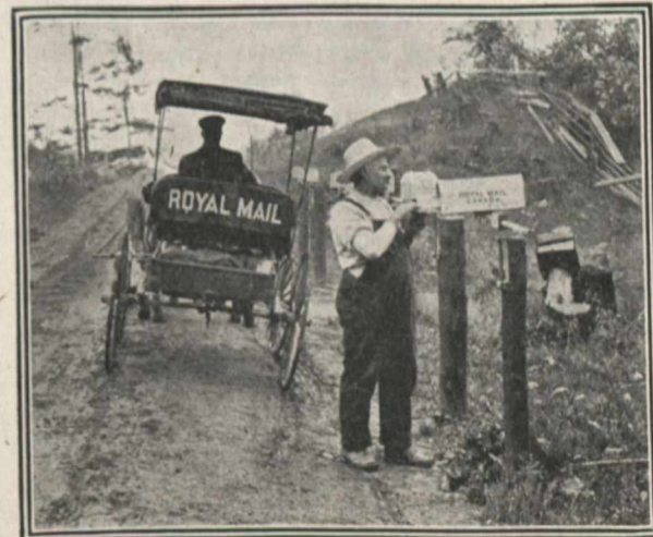
Will Rural Mail Delivery help?

It must be said that the government is moving constantly in the right direction. The steps they have already taken are making for more practical