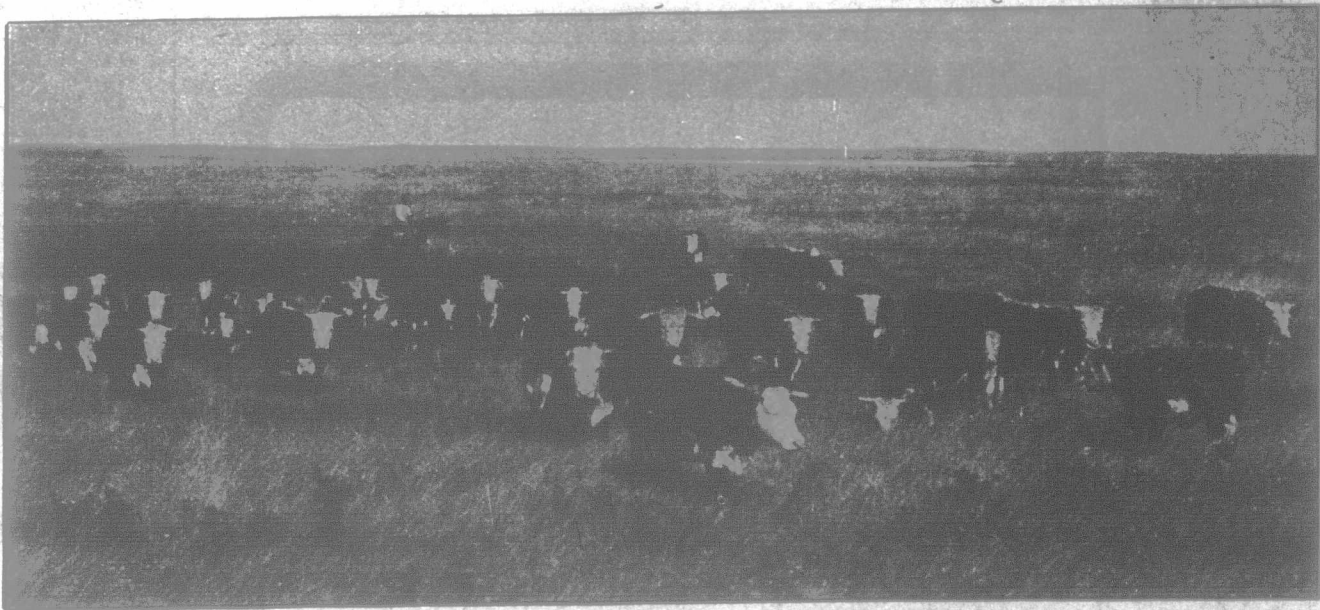
Hereford Cattle, Crane Lake, Assiniboia, Main Line Canadian Pacific Railway.

The Canadian Pacific Railway Company have 12,000,000 acres of choice farming lands for sale in Western Canada. Manitoba and Eastern Assiniboia lands generally from $4 to $10 per acre, according to quality and location. South-western Assiniboia and Southern Alberta lands, $3.50 to $8 per acre. Ranching lands generally $3.50 to $4 per acre. Northern Alberta and Saskatchewan lands generally $6 to $8 per acre.