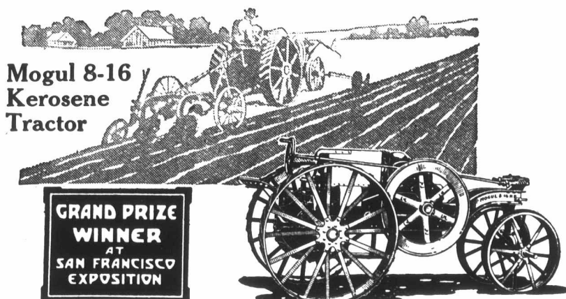
Mogul 8-16 Kerosene Tractor

GRAND PRIZE WINNER AT SAN FRANCISCO EXPOSITION