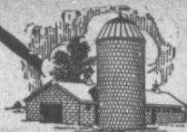
Patented and Protected under the British Title and the United States Title "Last for Generations"

—and settle it for good. Do away with repairs, with tightening of legs and adjusting of bolts. Know that your silo won't blow over, be sure of perfect silage at all times. Build the way you want.