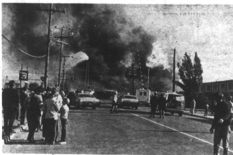
A crowd gathers on Airport Rd. as police, ambulances and fire trucks converge on the scene of the gas explosion, bursting into flames and causing a cloud of thick, oily smoke to whirl skyward. In the background firefighters have already begun spraying a gas station on the south-eastern corner of the Airport-Derry Rd. intersection in an effort to curtail the blaze to its immediate area. None could approach the inferno closer than about 200 yards because of the heat. Within half an hour thousands more people turned up to watch the fire wreak havoc.