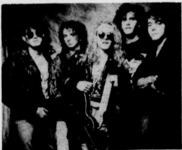
Haywire kicks butt