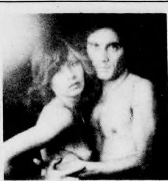
hair design for men and women

features: Space-Age Disco: Hot-Buttered Soul, Hard Rock, Hi-Life, Calypso, The "Now Sounds" from Motown, CBS, WEA etc.; Calypso, Reggae, etc. Food, Liquor (LCBO Lic.) Avail. Come One, Come All.