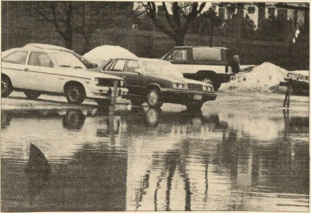
We really think that there's a drainage problem at the Dunn Building . . . this photo cost the life of a brave photographer whose last energies were spent throwing the camera on shore.

Of further importance to the DTUC students of writing is the school's emphasis on practical skills as a complement to creative ones. Students receive a grounding in the essentials of journalism, including production, layout, printing—and, yes, typesetting. Hence, a graduate from