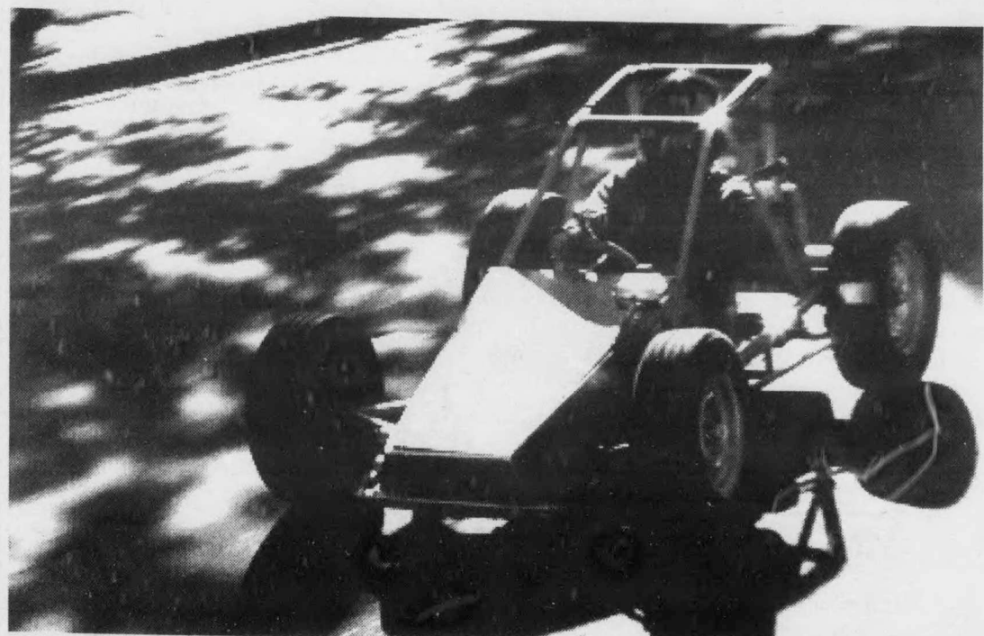
This isn't a picture of the winner, but its going downhill just like the rest of them.