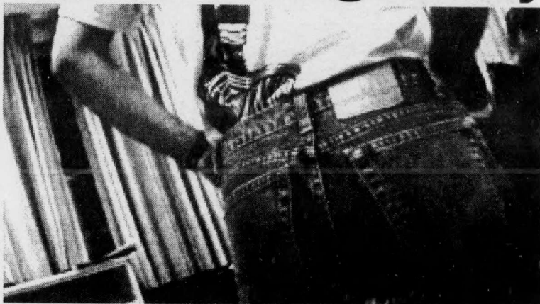
Demonstrating support for National Coming Out Day...