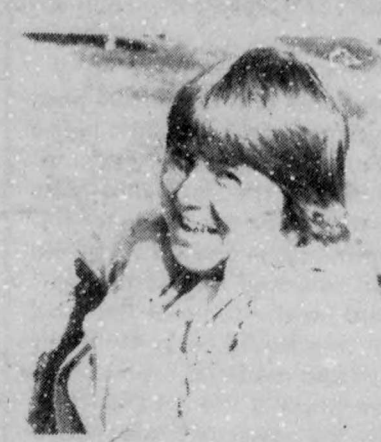
"No, we need more partying."