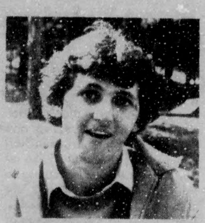
"No, there's not enough (it "No, not on campus, anyway." helps me study)."