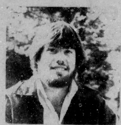
"I think they should install bars.