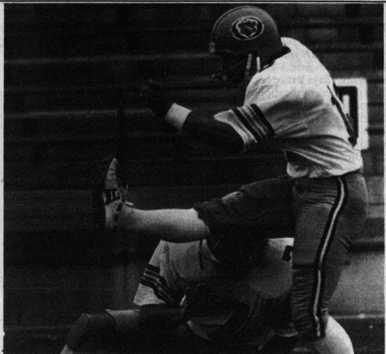
The weather didn't allow for much scoring Saturday, but football Bears prevailed anyway.