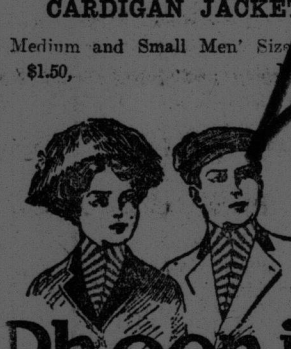
lar prices 50c., 75c, Clearing price 39c. Procedure Scotch H. Half

lar price $1.00, Clearing price 59c. $1.00 to $1.75, Clearing price 79c. Heavy Flannel and Tweed Shirts, regular prices $1.25, $1.50,