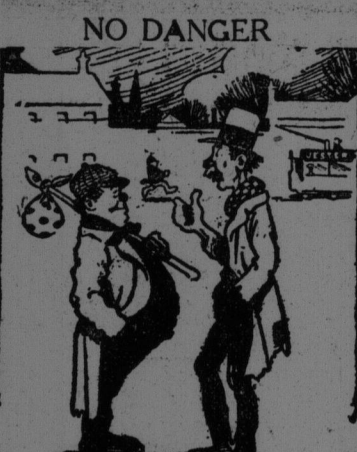
NO DANGER. First Tramp—"Everything is being done by electricity nowadays." Second Tramp—"Yes, but it won't ever ruin our trade."

The record is a remarkable one and it kept up will bring about the practical extinction of the disease almost within the life time of some now living. THE REASON. Paris—"How is it, Alice, that you never get a prize at school?" "Mamma—" "And that your friend Louise gets so many?" Alice (innocently)—"All but Louise has such clever parents."