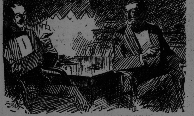
"But why do you allow your wife to run up such big bills?" "Because I'd sooner have trouble with my creditors than with her—that's why!"