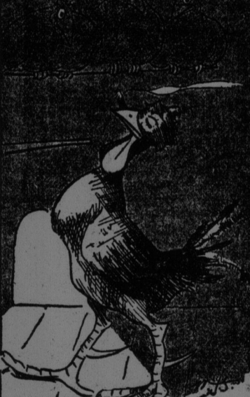
"He's the toughest rooster in the barnyard!" "Well, you see, he was hatched out of a hard boiled egg."