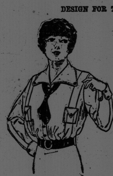
Ladies' shirt waist in plain linen trimmed with tailored box pleats, buttons and a satin four-in-hand tie.

No matter how fashionable the fancy blouse may be, the tailored waist will always be in demand. It meets a constant demand for smartness and simplicity in an every day waist. Linen is the most practical material for the tailored shirt waist. For a woman of average size 3 1/2 yards of 18-inch linen are required for this model. Some parts of the waist may be cut on open material and the others on a fold. The first step in making is to form a box-pleat in front, back and pocket, bringing together and stitching lap with a satin four-in-hand.