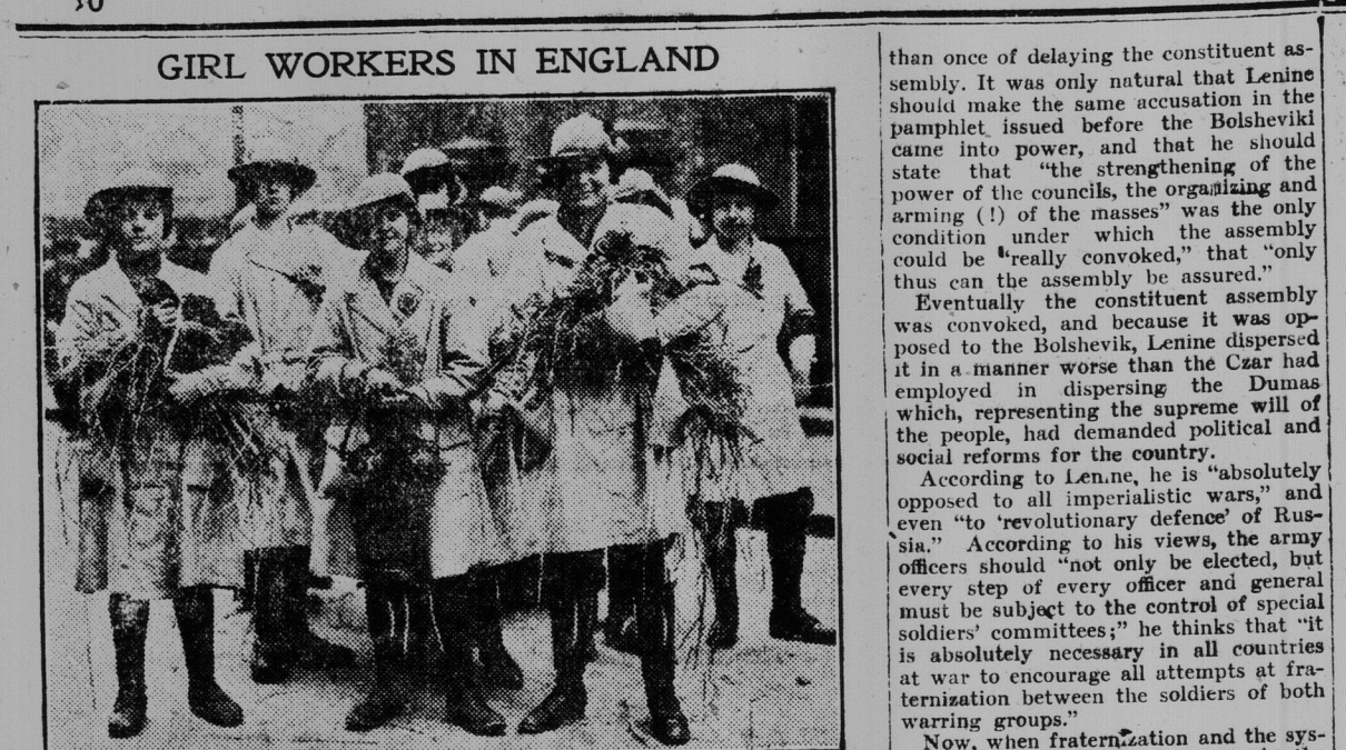
Girl workers in the land parade in London. Note the chickens and the

THE EVENING TIMES AND STAR, ST. JOHN, N. B., FRIDAY, JUNE 7, 1918