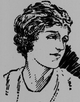
Mother is the Health Doctor

The Children's other mother believes in Lifebuoy too