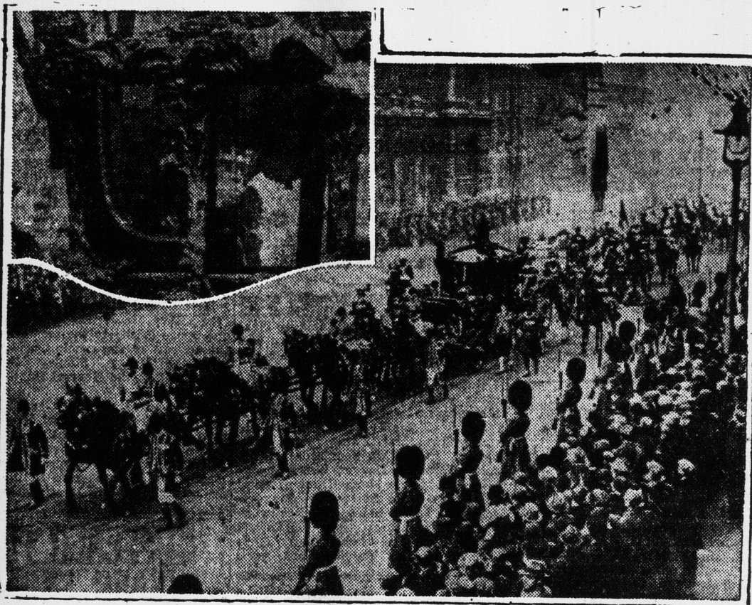
While royalty's prestige is waning in most of Europe, Britain's rulers are keeping their hold on popularity of the people. It is indicated by the great ovation given them when they rode in state to open parliament. The procession is shown. Inset is a view of King George V and Queen Mary in the state carriage.