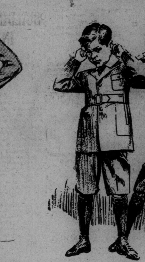
A. Is a smart single-breasted, all-round belted model, with combination buckle and button fastener, slash pockets, fancy back and full-fashioned bloomers, with belt loops, side, watch and hip pockets. Sizes 9 to 16 years. Price, $11.50. B. Is also of Palm Beach cloth, in the medium shade of grey, and in single-breasted, all-round belted style, with buckle fastener, fancy patch pockets, form-fitting back, and full-fitting bloomers, with belt loops, side, watch and hip pockets. Sizes 9 to 16 years. Price, $12.50.

For Boys Are Cool Summer Suits, Too Of Palm Beach Cloth, Which May Be Washed in Lukewarm Water