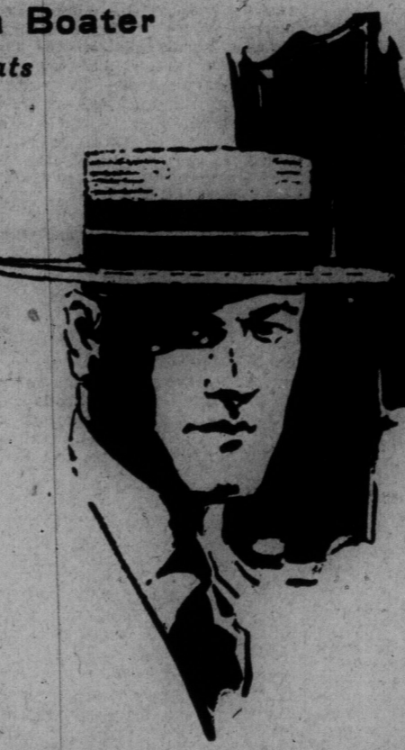
A. Is a Man's Panama Boater with 2 3/4" brim, 3 1/4" crown, leather sweat and black band. It is a cool, comfortable hat with the wearing and shape-retaining qualities so typical of a hat of South American palm leaf. Sizes 6 1/2 to 7 1/2. Prices, $5.00 and $7.00.