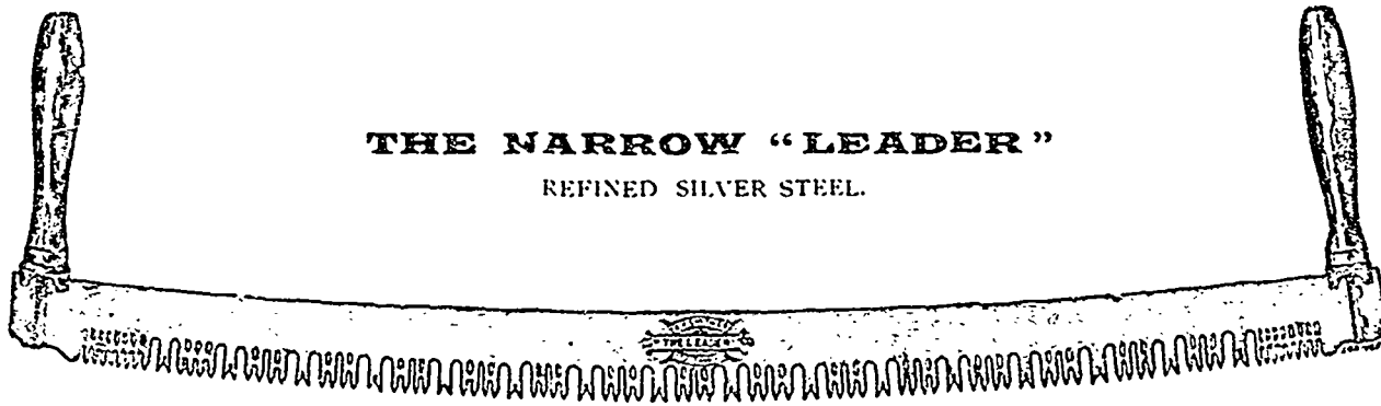
THE NARROW "LEADER" REFINED SILVER STEEL.

The Simond's temper and style of tooth make the "Leader" the fastest and easiest cutting saw manufactured.