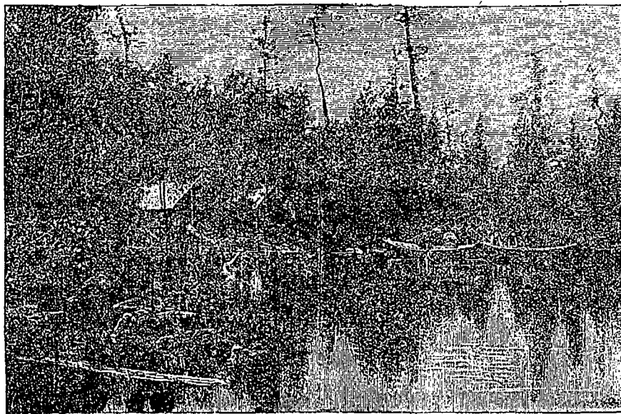
CAMPING AT BAKER LAKE. (From "Up the North Branch.")

The names of paid-up subscribers appear in our Subscribers' Direc- tory. They will tell you that they find a large increase in the number of magazines, newspapers and other mail matter received by them, while many a distant reader discovers a familiar name and address, and re- vives old time memories. Don't deprive your absent friends of the pleasure of knowing that you have an abiding interest in THE LAND WE LIVE IN.