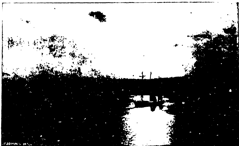
ST. JOHNS HARBOUR AT SUNSET.