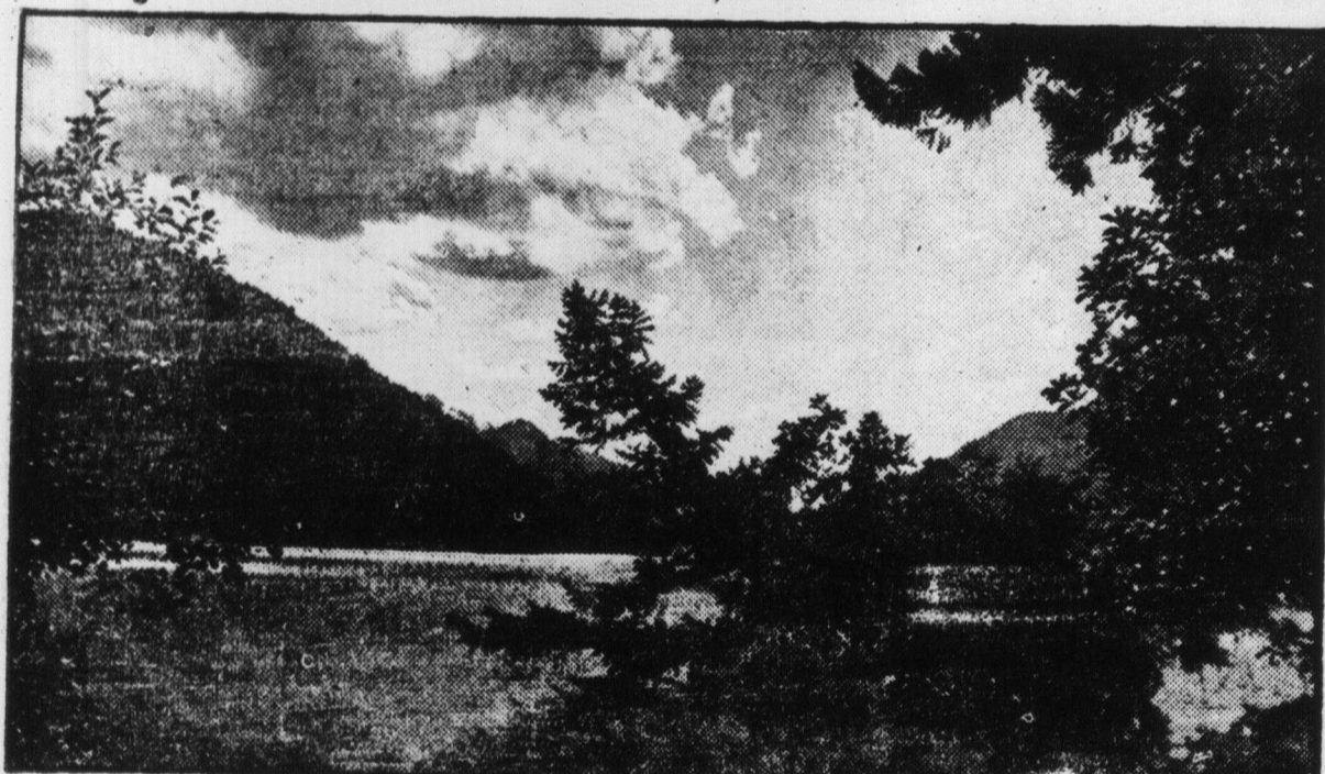
View of Sproat Lake, Vancouver Island.

"Truth," said one of the sages, "lives at the bottom of a well." She is also to be encountered in the great silent spaces. I met her on the pine-fringed shores of Sproat Lake, in the heart of Vancouver Island. She sprang unannounced from the lips of a handsome dame of healthy appetites and vigorous mind.