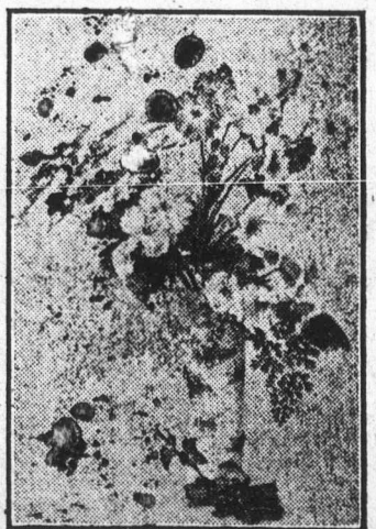
FIELD DAISIES AND FERNS.

Pottery jars and vases are, of course, very attractive for holding flowers when used on the porch as a decoration, but the most suitable receptacles