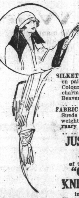
figure conspicuously in this sale