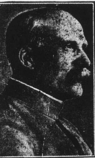
MARSHAL PETAIN, The hero of Verdun, who married a wealthy widow in Paris on Tuesday.