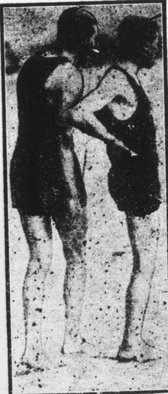
ON THE BEACH AT WAIKIKI. The Prince of Wales waiting to go surf-riding on the famous beach at Waikiki, Honolulu.

The handful of police soon had the mob under control. Father Burke led the police into the church. The negroes were hiding in a confessional. They were surrounded and taken from the church through a cellar door.