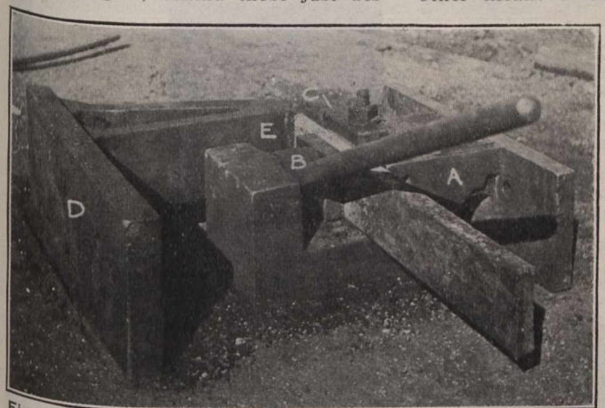
First Operation of Bending the Lugs on a Car-coupler Pocket.

The final operation of bending the coupler pocket to the U-shape is per-