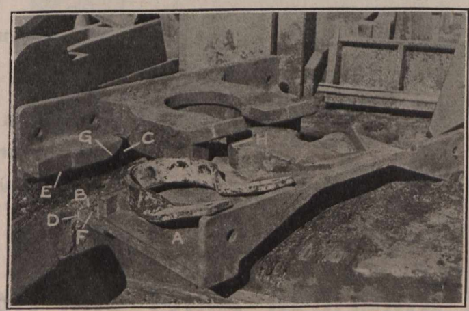
Fig. 6.—Bulldozer Dies for Brake-rod Stands.

chine. This die plate is provided with so that there will be no tendency for strain. Reference to fig. 2 will show