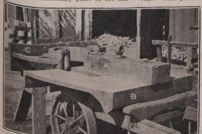
Fig. 5.—Final Operation of Bending Car-coupler Pocket to a U-shape.

formed by the dies shown in fig. 5. A small hole is punched in the straight stock, midway between the lugged ends. The central portion that is to be bent, is then heated to a working heat, and