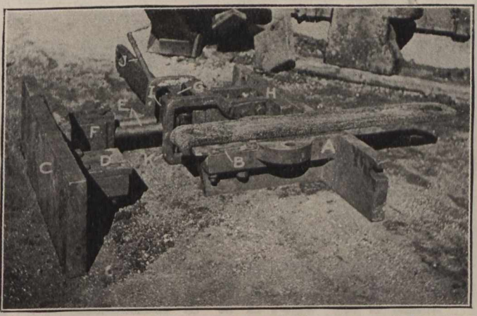
Fig. 4—Second and Third Operations of Trimming and Punching the Ends of the Car-coupler Pocket.

cribed. Two punches E are attached, as indicated, to a head F bolted to the bulldozer ram. Corresponding dies in equed to the stationary plate of the ma-