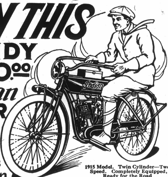
1915 Model. Twin Cylinder—Two Speed. Completely Equipped, Ready for the Road