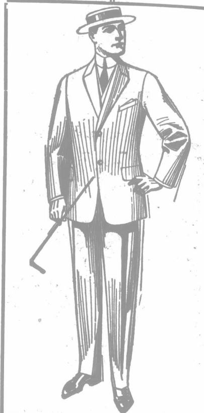
The "ANDOVER" is the fashionable type of single-breasted, two-button suit that is now being worn extensively in London and New York. You will be delighted with it.