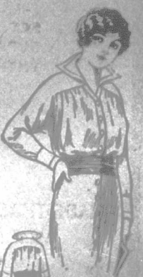
8382 Yoke Blouse, 34 to 42 bust.

No friction windmills always Hub and all Complian of Write