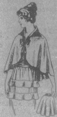
8330 Short Cape, One Size.