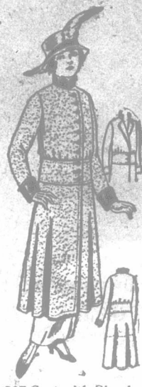
8397 Coat with Circular Skirt for Misses and Small Women, 16 and 18 years.