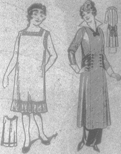
8374 Girl's Princess Slip, 8 to 14 years. 8386 Polonaise, 34 to 44 bust.