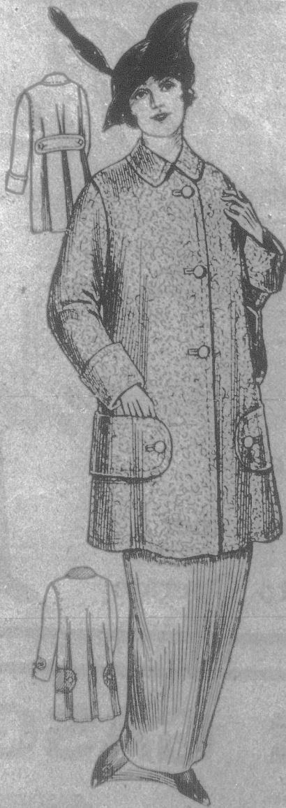
DESIGN BY MAY MANTON. 8290 Loose Coat, 34 to 42 bust.