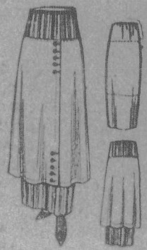
8363 Two-Piece Skirt with Tunic for Misses and Small Women, 18 and 18 years.