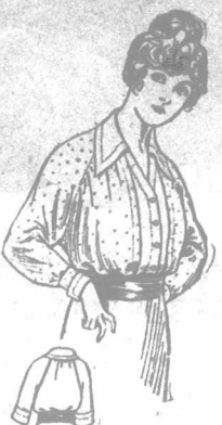
8385 Blouse with Vest Effect, 34 to 40 bust.