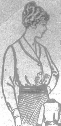
8375 Plain Blouse, 34 to 42 bust.