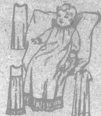
8291 Infant's Set, One Size.