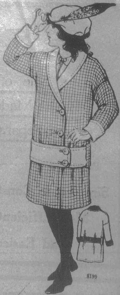
DESIGN BY MAY MANTON. 8199 Girl's Coat, 10 to 14 years.