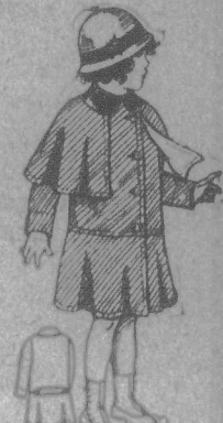
8400 Girl's Coat, 4 to 8 years.