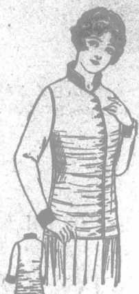
8392 Gathered Basque, 34 to 42 bust.