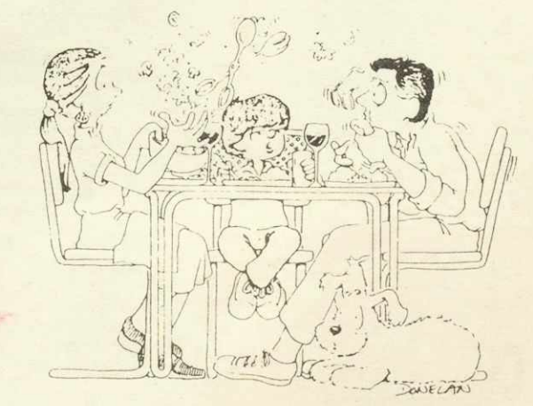
I hope you realize that your heterosexuality will not necessarily prejudice my eventual affectional-preference choice.

Remember though: in or out of the 'plex, KEEP IT SAFE.