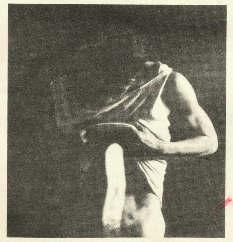
sexuality became more and more apparent.

SPORTS NOT THE ONLY OUTLET Although the athletes in this picture may not know it, sports is not the only fun way for two people of the same sex to bond.