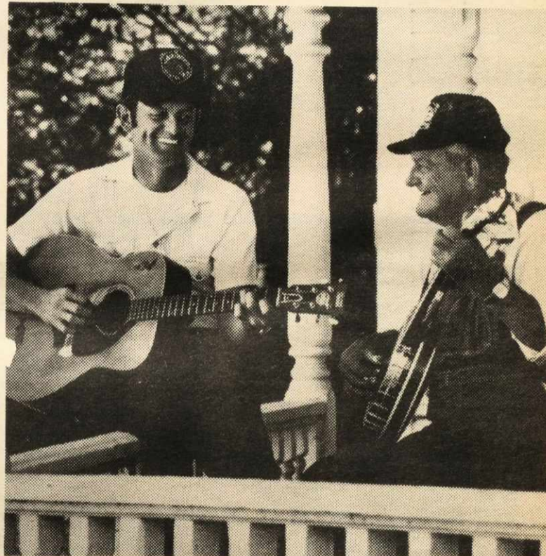
Jack Daniel's Tennessee Whiskey is represented in Canada by FBM Distillery Ltd., Brampton, Ontario

451 Windmill Road (Shannon Plaza) 469-5070