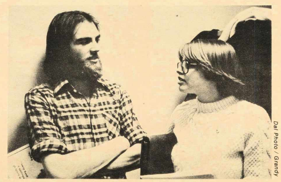
AFS caucus chairpersons, old and new.

for the National Union of Students, told delegates they must continually gather information and keep the cutbacks issue alive on