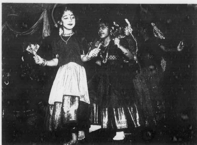
Everybody dances at India Night...

The streamers so proudly decorating the centre of the cafeteria represented the colours of India's flag. If that wasn't enough, entertainers were dressed in a variety of colours including what I might describe as taxicab yellow and hot pink. When it comes to colours, Indians sure don't hold back. Among many other dances and musicals, the show included the Holi dance. Paints and powders are not permitted in the SUB which would be a customary part of the Holi dance; as a result, we were witness to bright colourful outfits and lively dancing.