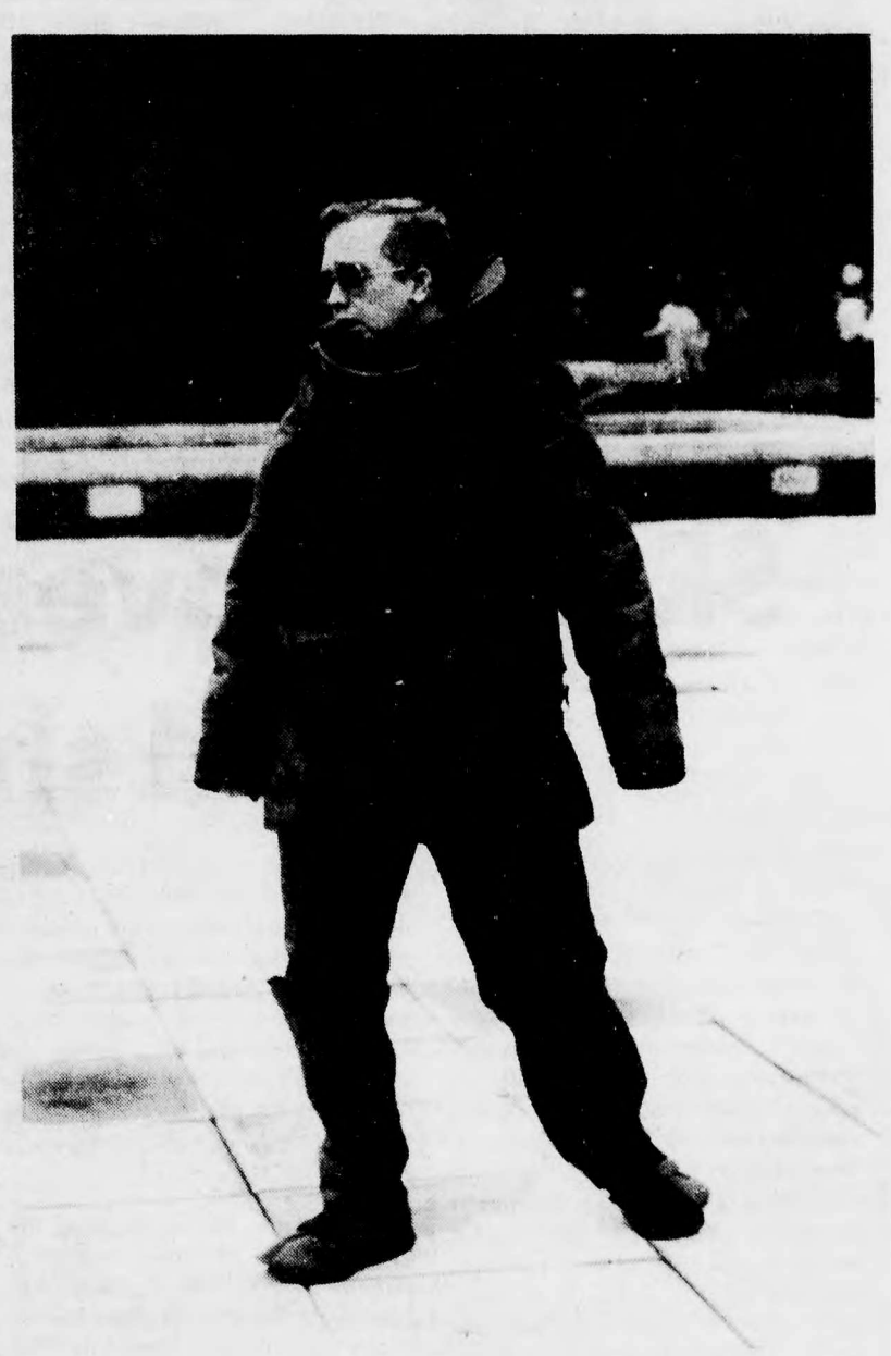
JUDY KAVANAGH Photo