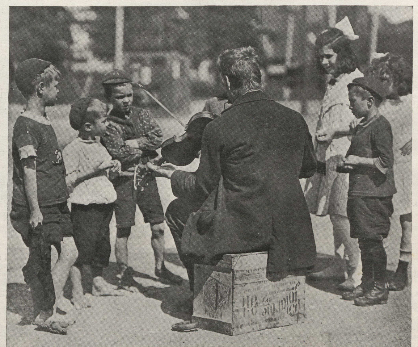
NO MORE GERMAN BANDS The mendicant violinist with the mouth-organ attachment is now the juvenile attraction on suburban street-corners.