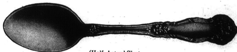
(Half Actual Size)

Extra spoons are always useful and these, besides being useful, are very handsome and guaranteed for twenty-two years. They are manufactured by the famous Rogers firm.