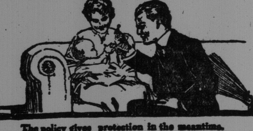
The policy gives protection in the meantime.