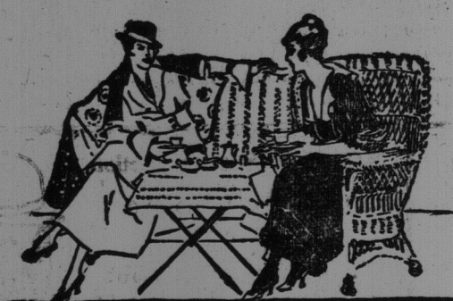
An Endowment is something to be proud of.

A policy in the Canada Life adapts itself to every period in a woman's life: