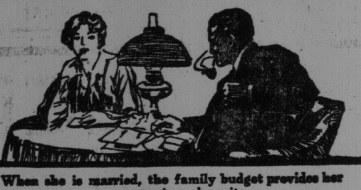
When she is married, the family budget provides her premium deposits.