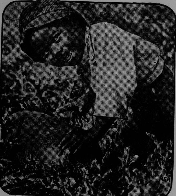
This may be a mighty tough summer for some people, what with politics, the high cost of living and so on, but this colored lad doesn't care. 'Cause it's melon time down in Georgia—and look what he found!