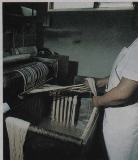
The guts are then fed through a stripping machine which squeezes out the softened contents in preparation for the next stage of manufacture.