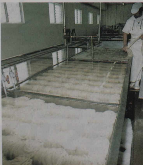
The removal of the gut contents and mucous is achieved by soaking in a brine and chemical solution for 24 hours to achieve softening.