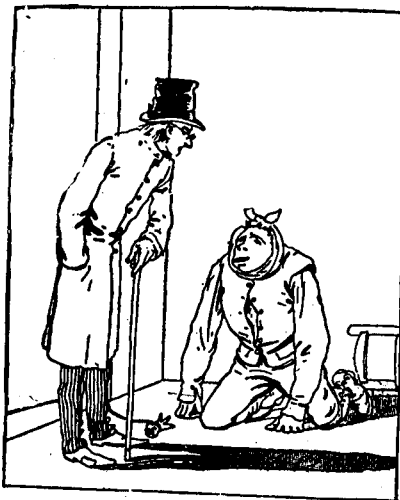
"ENTER a visitor. Exit [the tooth. Tableau!"

Law and Commercial Stationers, Lithographers, etc., Writing Machine Papers and General Supplies.