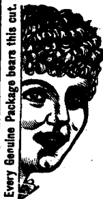
Every Genuine Package bears this cut.

Dorenwend's Latest invention for Curling, Crimping and Frizzing the Hair. Reasons why ladies should use CURLINE : It is simple in application. It retains its influence for a great length of time. It adds lustre, life and beauty to the hair. It avoids excessive use of irons, etc. It is inexpensive. It is entirely free from harmful properties. It saves time and trouble. It is neither gummy nor sticky. For sale by all druggists. Price 50 cts. each, or six for $2.50. By mail, 8 cts. each extra. Manufactured only by