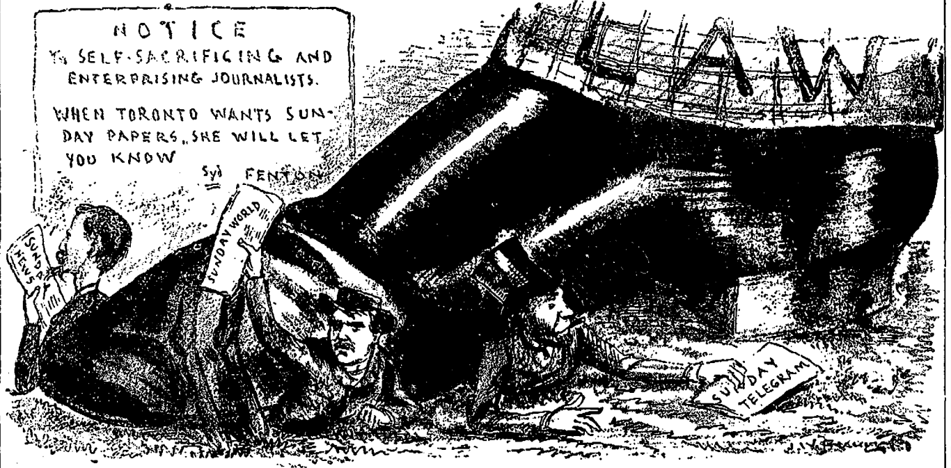
PUBLIC OPINION PUTS ITS FOOT ON 'EM.