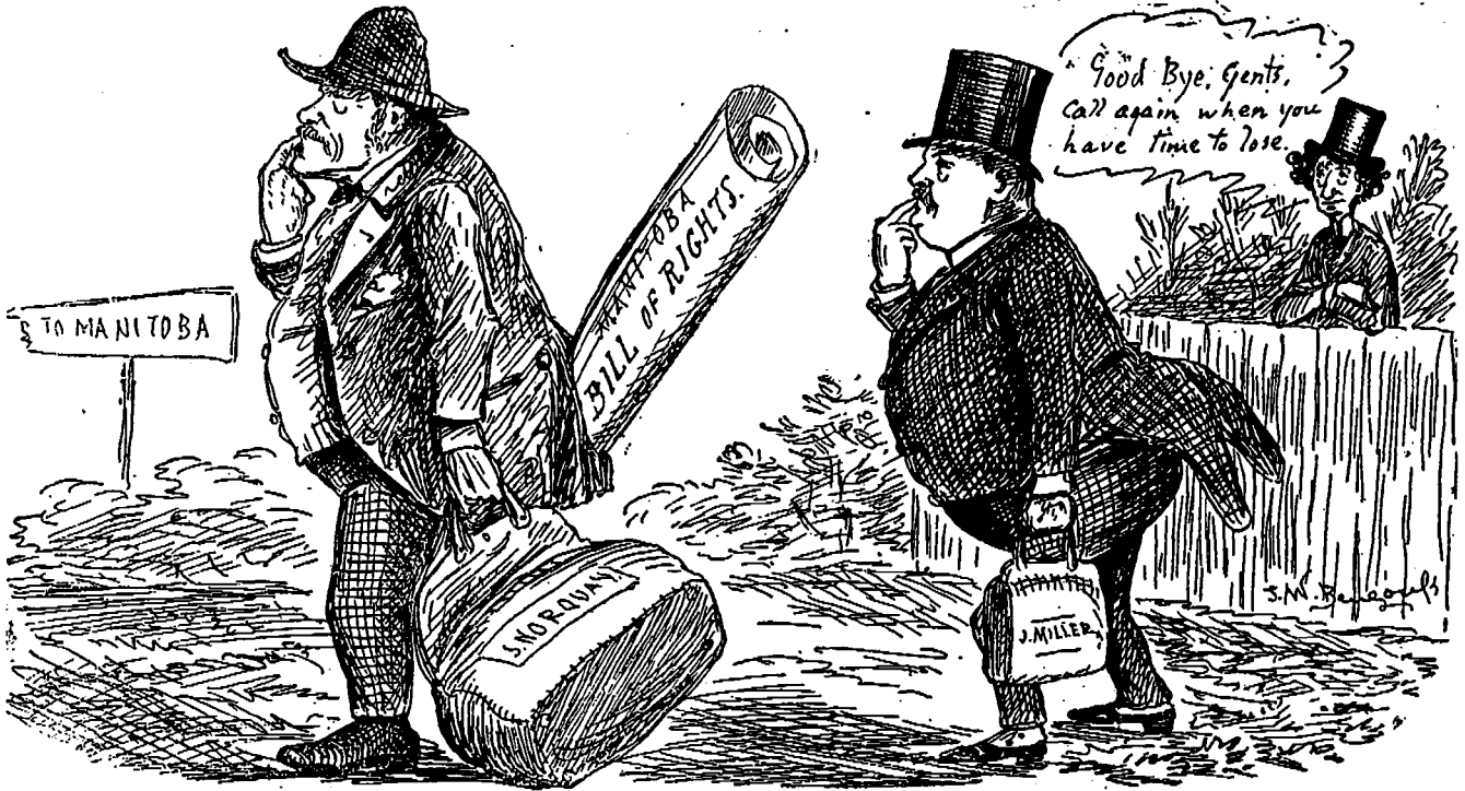
THE MANITOBA DELEGATES ON THEIR WAY HOME.

97 to 107 Duke St., Toronto. Barchard & Co., Manufacturers of WOOD PACKING BOXES of every description. All Work Guaranteed. Pioneer Packing Case Factory