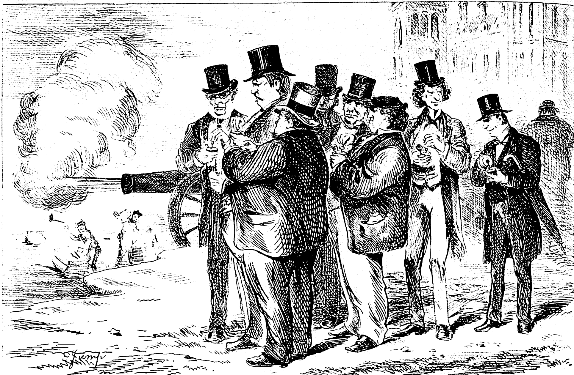
THE MIDDAY GUN AT OTTAWA.

IMPORTANT TO PARTIES OWNING OR USING MACHINERY.