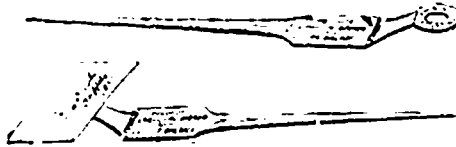
Warwick Bros. & Rutter.

Another shipment of the famous Pelouze letter scales has been received, among them being the handy letter scale and paper-cutter combined. This is the most simple and handy paper-cutter and scale combined on the market, and retails at a