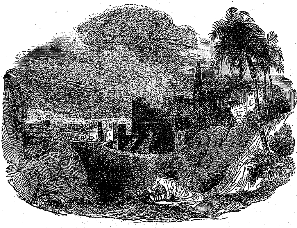
WALLS OF JERUSALEM.

IN Youth, it is comparatively easy to modify the manners, and to learn to act and speak gracefully; in later years, it is far more difficult; sometimes, almost impossible.