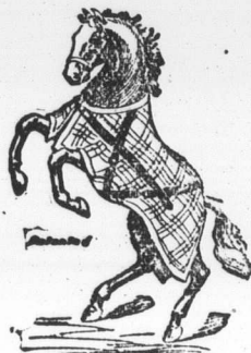
5/8 BIAS GIRTH Blanket Can't Slip Won't Come Off.